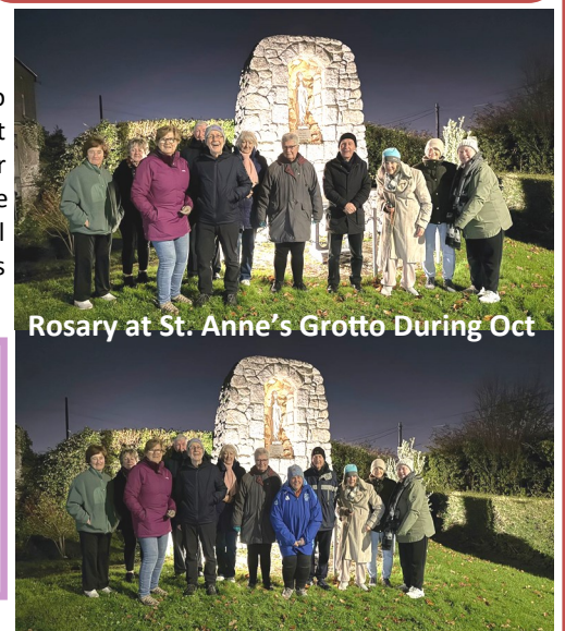
Rosary at St. Anne's Grotto During Oct

Please note there will be no 10am mass in St. Anne's on Friday 7th November .