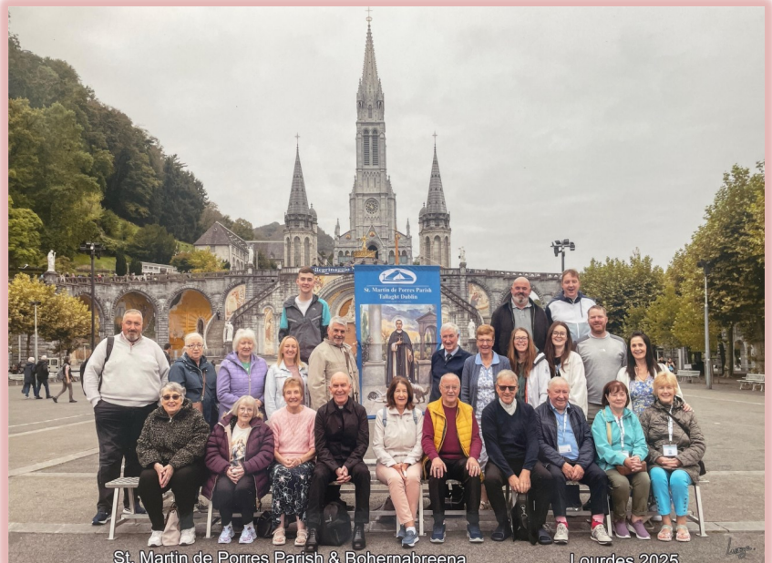
St. Martin de Porres Parish & Bohernabreena