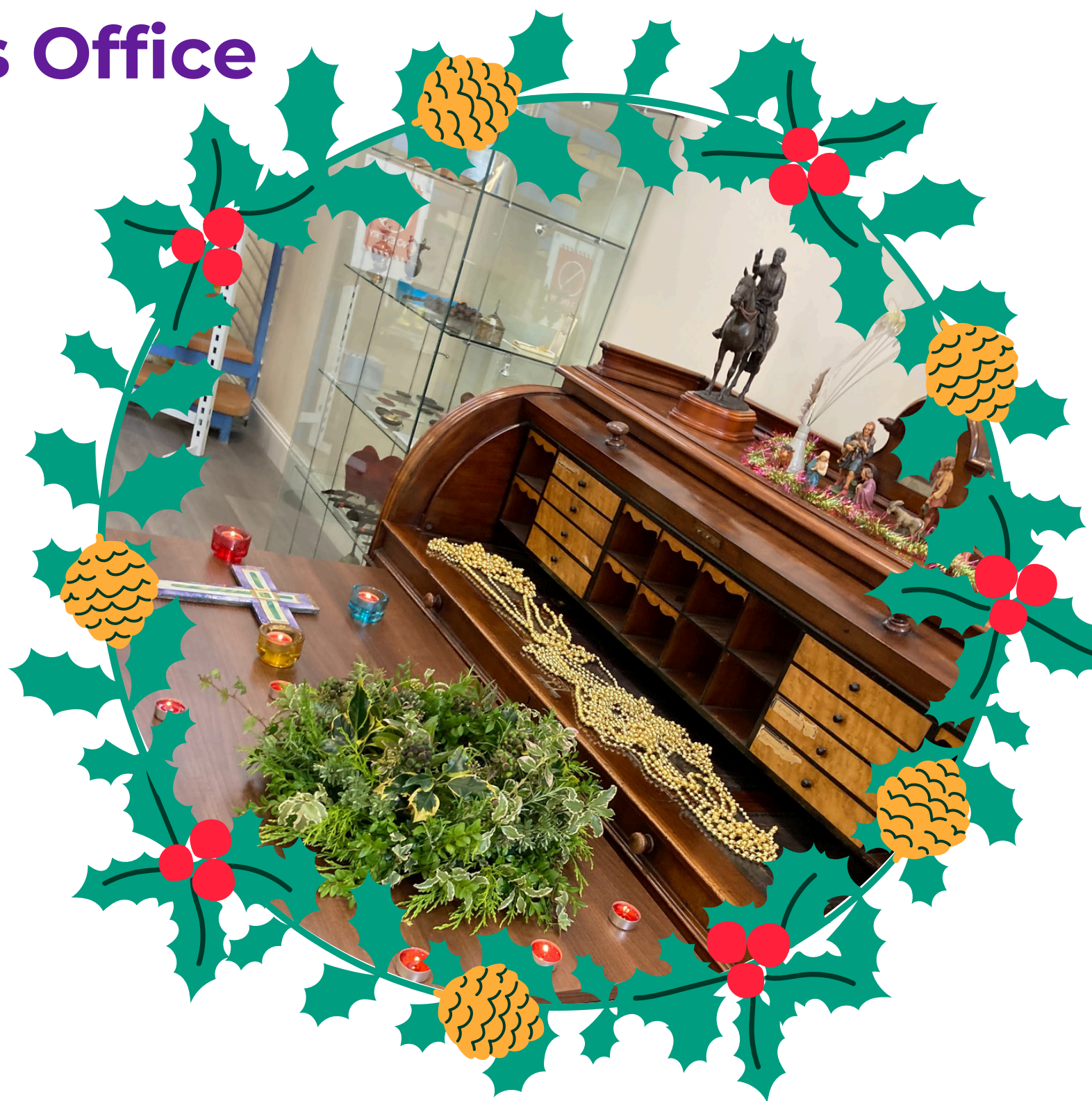
Prayer Moment at The Archives