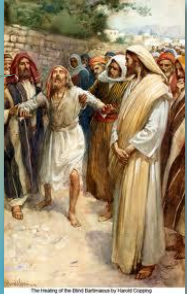
The Healing of the Blind Bartimaeus by Harold Copping