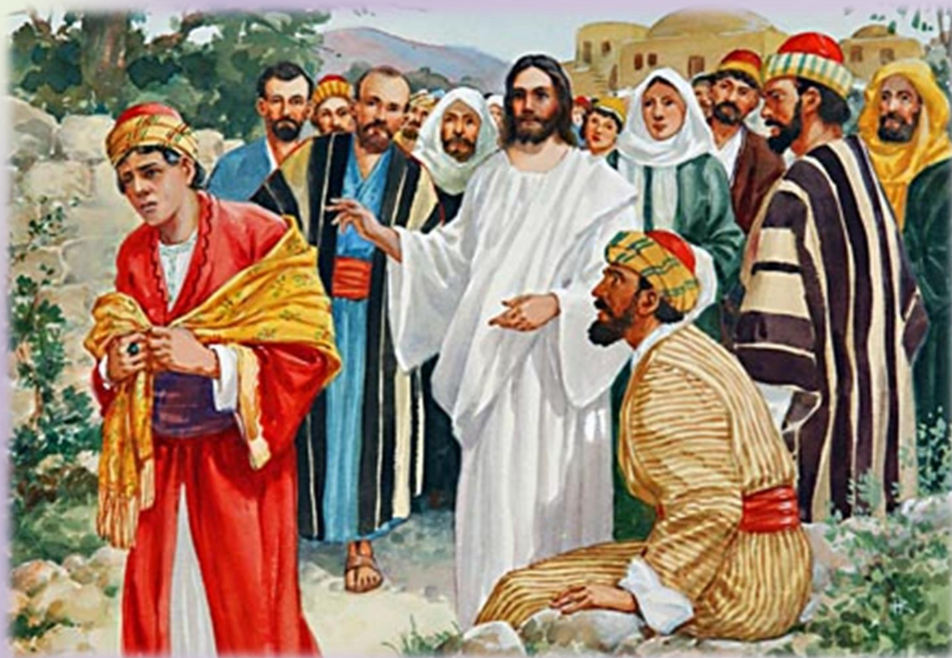
The Rich Young Man