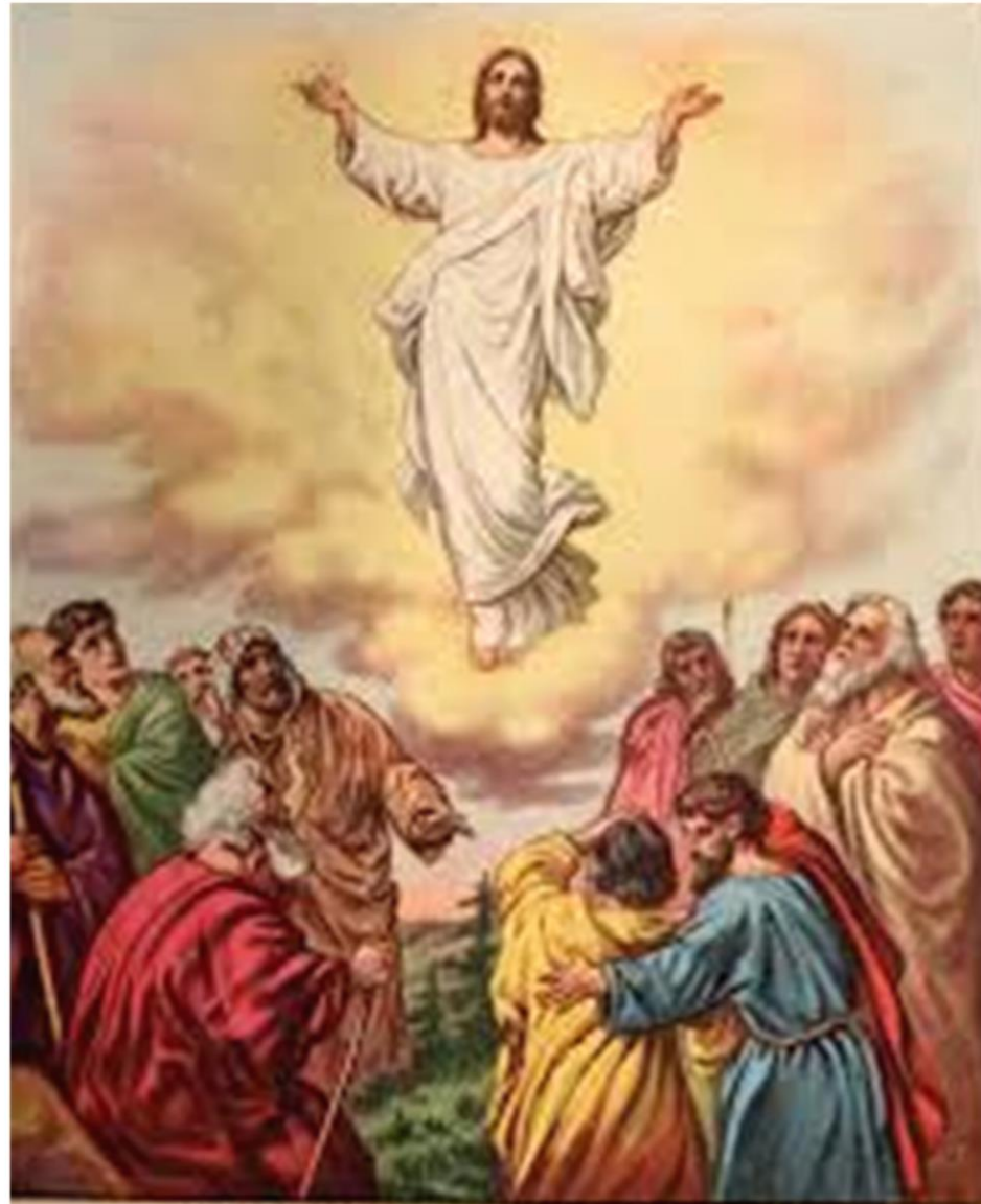
Jesus going to the heavenly home