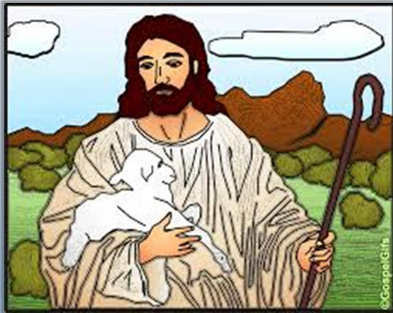
Jesus the Good Shepherd