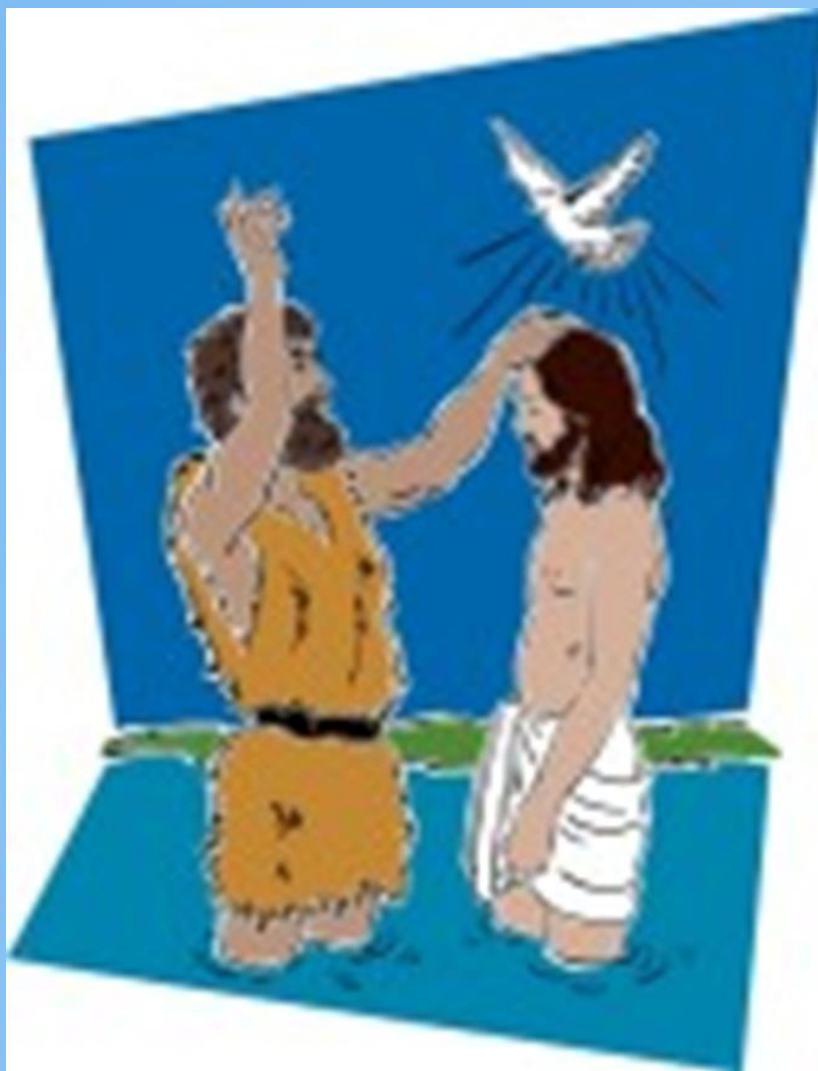
The Baptism of Jesus